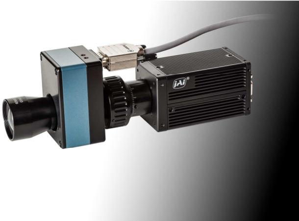
SYSTEC optical measuring system OMS 4.0

In addition to traditional AOI requirements such as shape matching and pattern matching, the specifications sheets of many OEMs (not just in the automotive industry) call for a growing number of photometric analyses such as luminance, dominant wavelength and chromaticity coordinate.